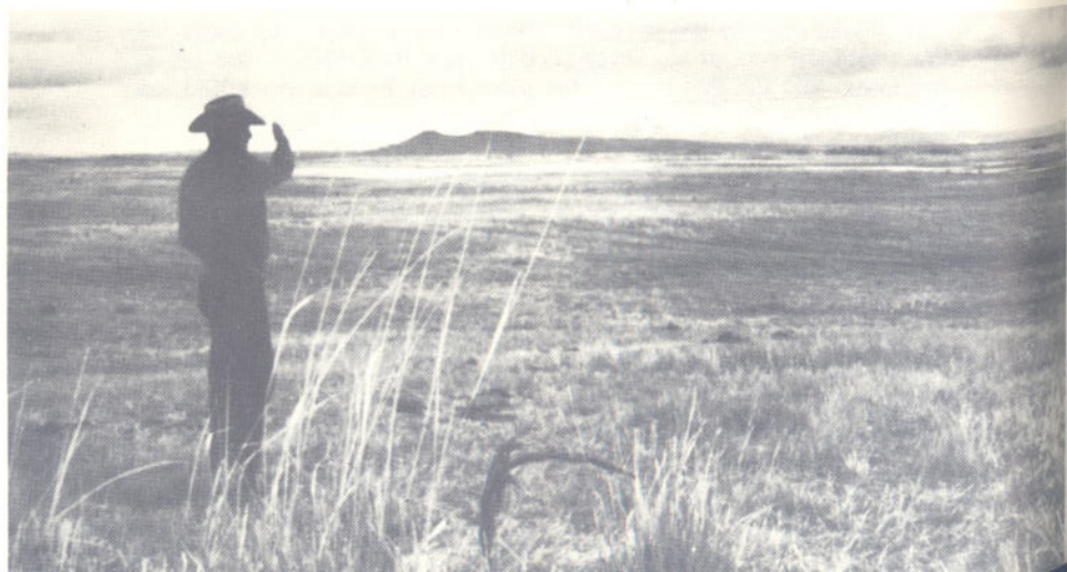
View No. 5, east toward Steens, across Blitzen River and Notch Butte.

These photographs give a view of the country in a circle around the approximate location of the place where French was shot, and the map indicates direction of view. In picture No. 3 the mountain in the far distance is Jackie Butte; in No. 4 are what we called Buena Vista Rims; in No. 5 is Steens Mountain showing snow, and to the northeast is Riddel Mountain.